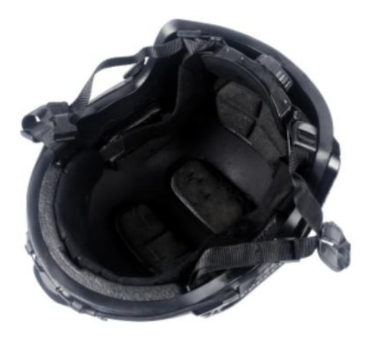
Suspension system inside helmet

Longfri Ballistic Helmet protects against: